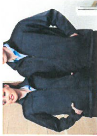
Navy soft shell zip up jacket with logo and matching soft shell zip up vest with logo