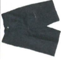
Navy formal shorts in stud or elastic waist.