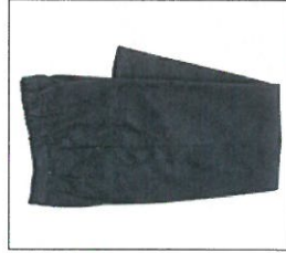
Unisex navy formal pants in stud or full elastic waist