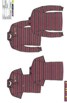
Short and long sleeve polo tops with the logo. A long sleeve navy t-shirt can be worn under the long sleeve polo for added warmth (available from uniform shop)