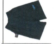
Unisex sports shorts and trackies